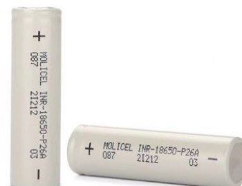
Original MoliceI P26A